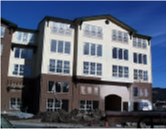
Lofts at Albert Park

Lofts at Albert Park, San Rafael, CA (2001)